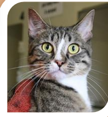
Mustard & Pepper Young males